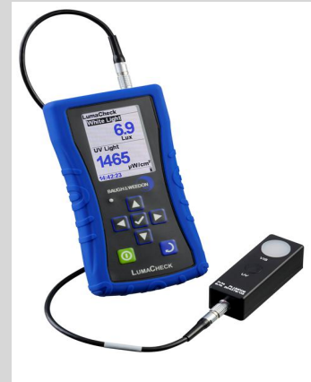
White and UV meter