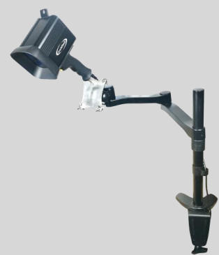
Mounting with CHiNDT FlexArm