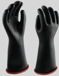
UV shield gloves