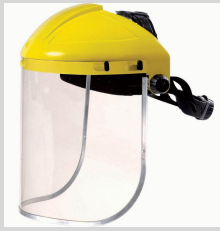
UV shield mask