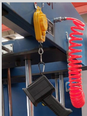
Mounting with spring balance and hook