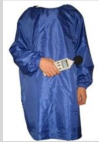
UV shield clothes