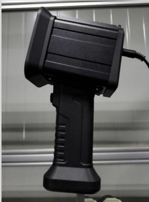
Mounting on a steel rod for mains version